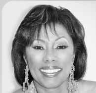
MISTRESS OF CEREMONIES