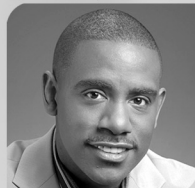
MASTER OF CEREMONIES